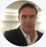
Kris Blamires Digital Criminal Justice Lead Metropolitan Police