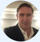
Kris Blamires Digital Criminal Justice Lead Metropolitan Police