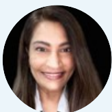
Geeta Nastasi CNO Northwell Health