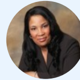
Evette Maynard-Noel Deputy CISO Cybersecurity and Infrastructure Security Agency